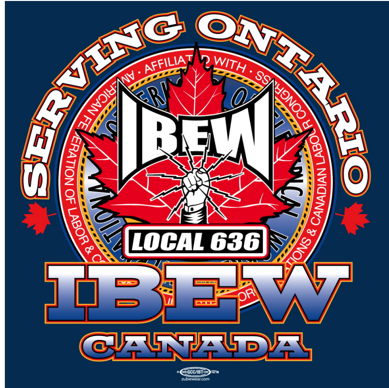
MEN'S CREW NECK - LOGO (BLUE LONG SLEEVE) -Union made in U.S.A. - 100% pre-shrunk cotton (no pocket)

Price: $28.00 (Long Sleeve); $22.00 (Short Sleeve)