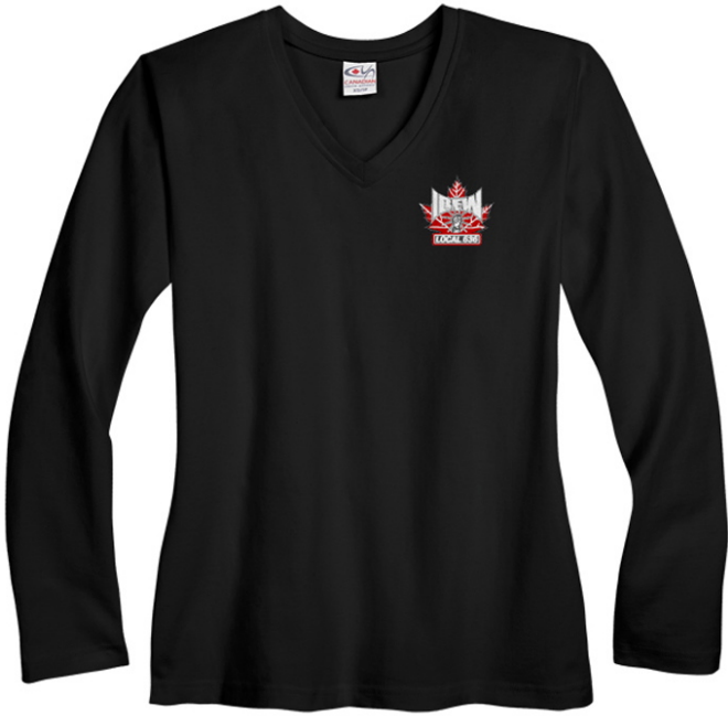
WOMEN'S V-NECK (BLACK LONG SLEEVE)

-Union made in Canada - 95% cotton/ 5% spandex