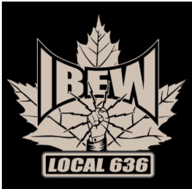
LOGO SCREENED ON FRONT LEFT

Price: $26.00 (Long Sleeve); $17.00 (Short Sleeve)