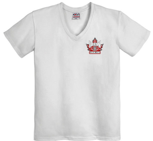
WOMEN'S V-NECK (WHITE SHORT SLEEVE)

-Union made in Canada - 95% cotton/ 5% spandex