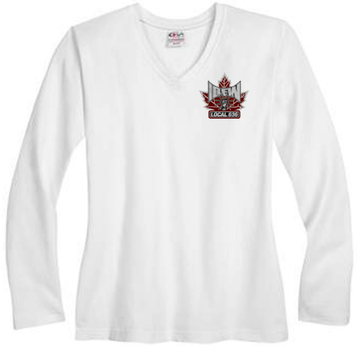
WOMEN'S V-NECK (WHITE LONG SLEEVE)

-Union made in Canada - 95% cotton/ 5% spandex