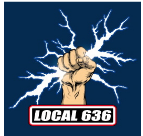
LOGO SCREENED ON FRONT LEFT