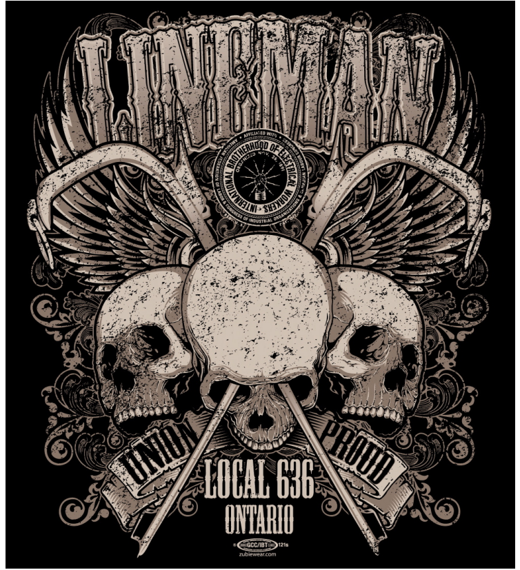
MEN'S CREW NECK - LINEMAN (BLACK)

Price: $26.00 (Long Sleeve); $17.00 (Short Sleeve)