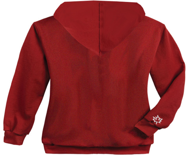
FLEECE-LINED SHERPA JACKET (RED HOODIE - FULL ZIP)