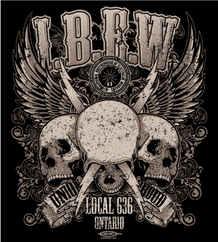
MEN'S CREW NECK - IBEW (BLACK)

-Union made in U.S.A. - 100% pre-shrunk cotton (no pocket)