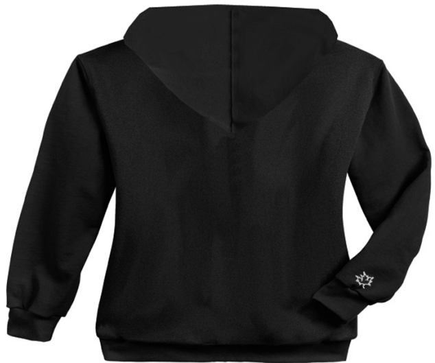
FLEECE-LINED SHERPA JACKET (BLACK HOODIE - FULL ZIP)