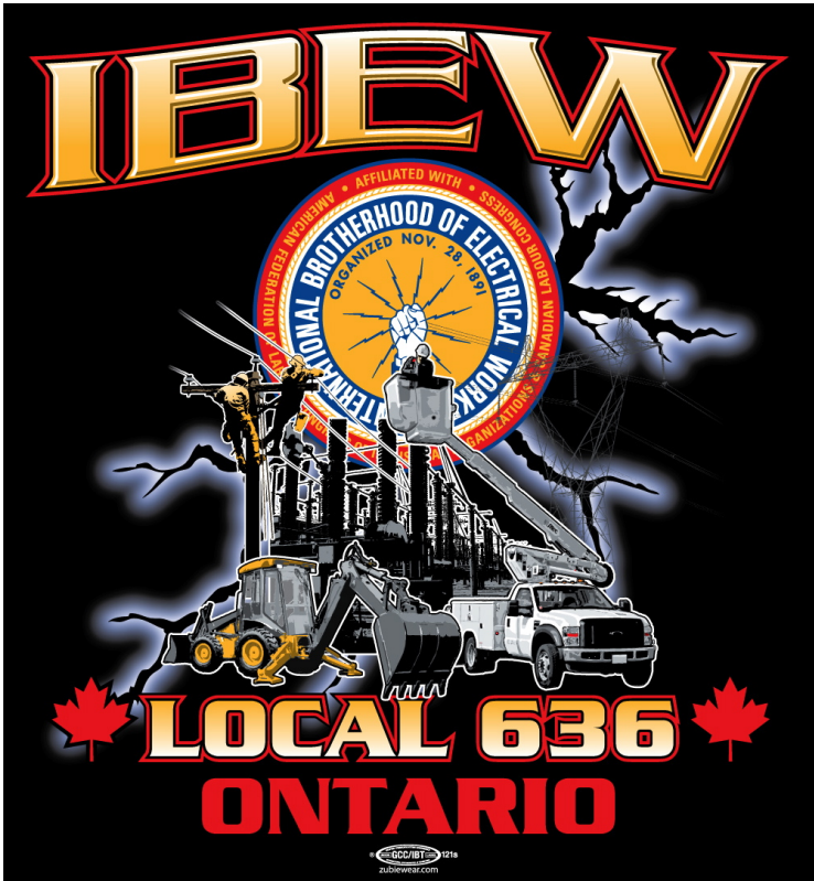
MEN'S CREW NECK - IBEW UTILITY (BLACK LONG SLEEVE) -Union made in U.S.A. - 100% pre-shrunk cotton (no pocket)