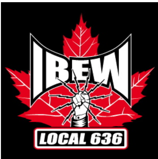
LOGO SCREENED ON FRONT LEFT

Price: $28.00 (Long Sleeve); $22.00 (Short Sleeve)