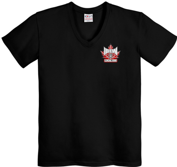
WOMEN'S V-NECK (BLACK SHORT SLEEVE)

-Union made in Canada - 95% cotton/ 5% spandex